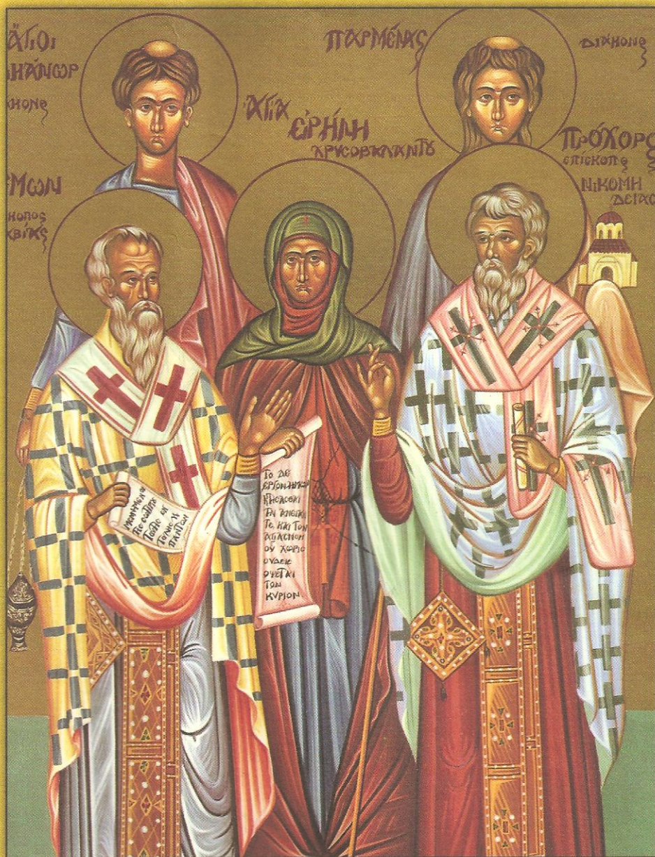
Icon of Saint Prochorus and Others -- July 28th